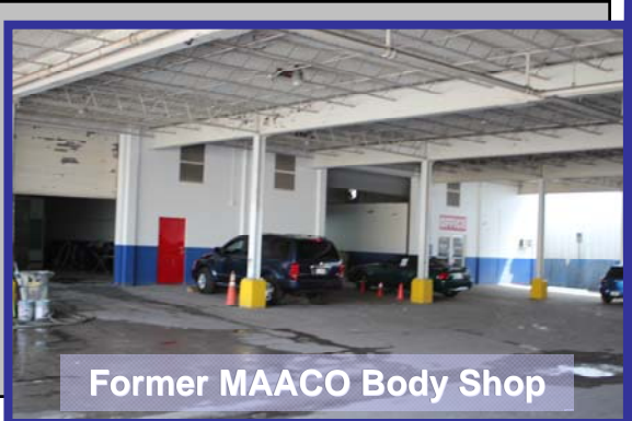
Former MAACO Body Shop

Just off NW 103rd Street and the Palmetto Expressway