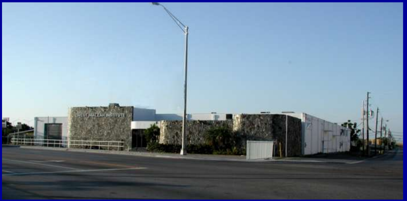
Corner of NW 79 Avenue and NW 103rd Street