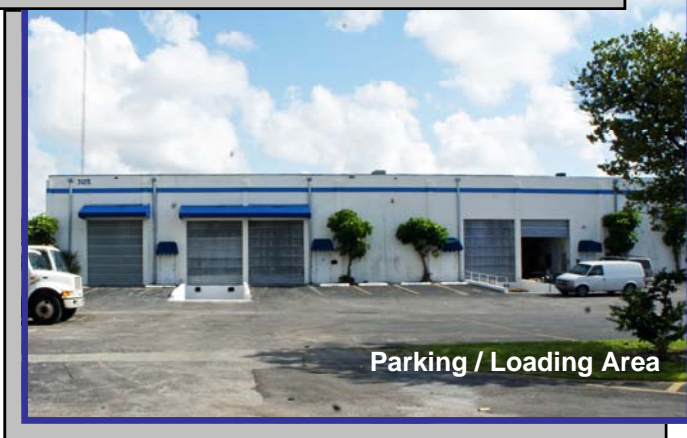
Parking / Loading Area

This information is believed to be accurate, and has been obtained from sources deemed to be reliable. All information should be verified independently. We are not responsible for misstatements of facts, errors, omissions, prior sale, price change or withdrawal without notice.